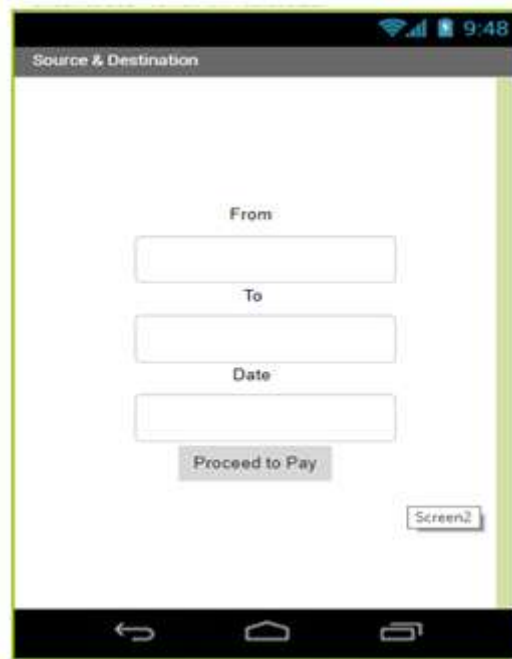
Diagram no. 2: Source and Destination [7], [8]