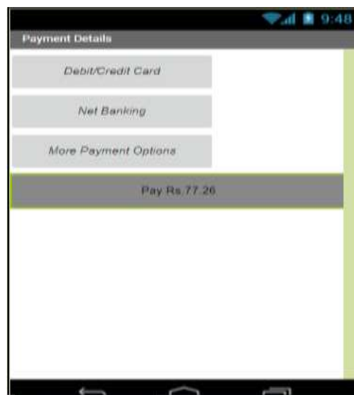
Diagram no. 3: Payment Session [7], [8]