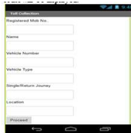
Diagram no. 1: Vehicle Details [7], [8]